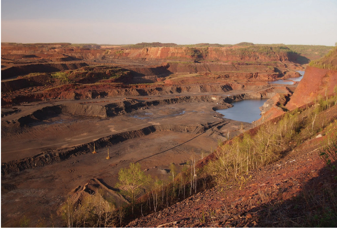
FIGURE 1.6 Example of an open pit mine.

Once the raw material is extracted from a location, it is transported to a primary processing plant for processing and refining. This stage is the most highly toxic phase and involves massive chemical and energy inputs, as illustrated next.