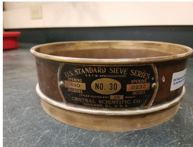
FIGURE 1.2 Sieve.