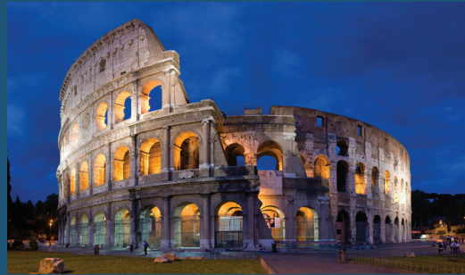
FIGURE 1.5 Colosseum in Rome.

The Colosseum in Rome is a great example of a building with sustainable materials. The main structural pillars and external walls (still standing today, as shown in figure 1.5 ) were made from limestone from Tivoli, only 20 kilometers away. At the end of the structure's useful life, stone from the façade was recycled to make the steps of the city's churches, including those of St. Peter's Church, and 300 tons of metal clamps (used to hold the decorative stones) were recycled to make weapons in the Middle Ages. The evidence of this building's continued existence almost 2,000 years later, and its ability to be re-used over the years, certainly speaks to the sustainability of its construction!