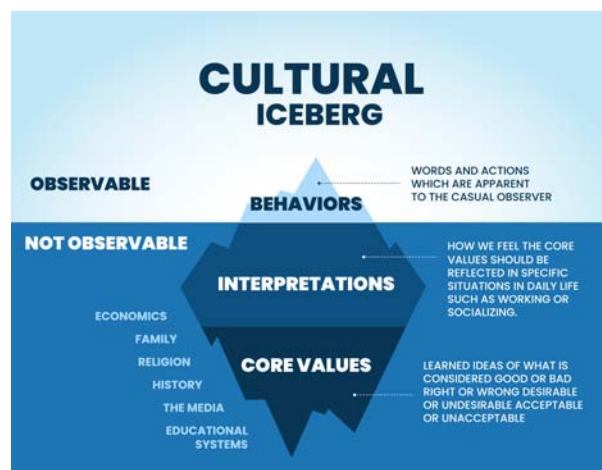
Figure 1.11 The Iceberg Concept of Culture.

When we understand our identities, we start to understand that there are various parts to who we are. This is incredibly important in connecting with others and creating more inclusive and equitable environments for everyone. As someone who taught high school English for a long time, I am reminded of something Harper Lee wrote in To Kill a Mockingbird . Atticus explains to his daughter Scout that “you never really understand a person until you consider things from his point of view ... until you climb inside of his skin and walk around in it.” That is our goal here. To understand our own skin so we can better understand those who interact with the world differently than we do.