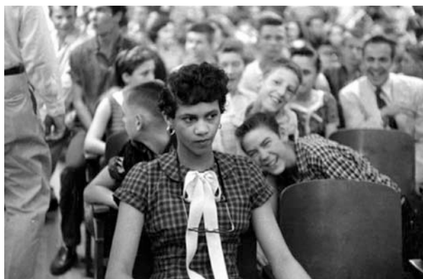
Figure 0.2 Dorothy Counts.

Our lack of exposure leads to a caricatured view of those who are different from us; our ideas of them are oversimplified and exaggerated. The tricky thing about them is that we may not know they are stereotypes, as they might really be all we have been exposed to (usually through the media) about people with whom we may differ. The stereotypes we have lead us to have gaps in perception in