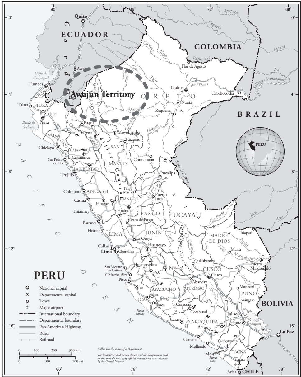
Edited by Randy E. David, May 2019 (United Nations. 2011. Map no. 3838, rev.4. Department of Field Support Cartographic Section. https://www.un.org/Depts/Cartographic/map/profile/peru.pdf )